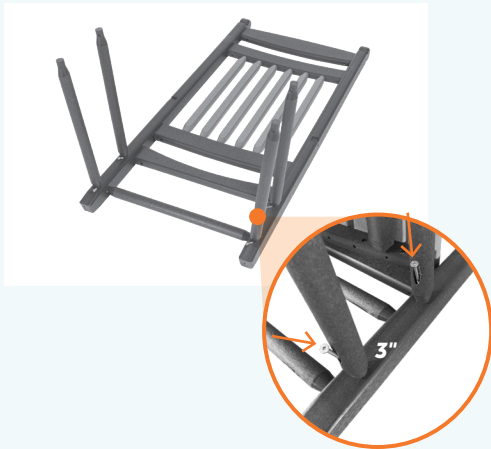
1 - 18" and 2 - 21½" Dowels, Back Assembly, 3" Screws.

First, lay down back assembly. Now insert each dowel into the correct mortise. Next tap with a rubber mallet for a tight fit. Finally, assemble using the 4 - 3" screws on each side.