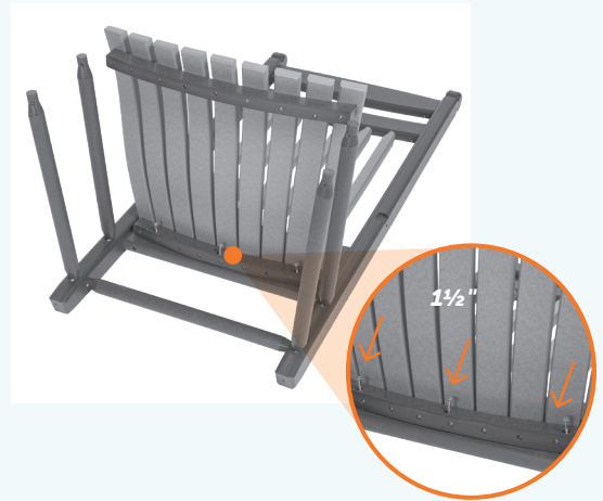
Seat Assembly, 1½" Screws

Now, use the 1½" screws to attach the seat assembly to the back assembly.