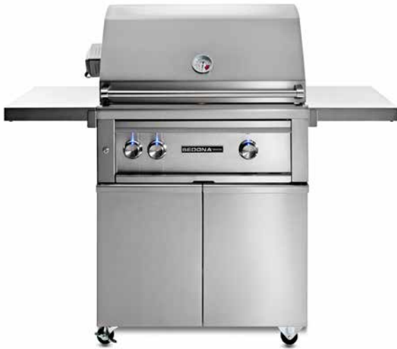
30" GRILL AND CART