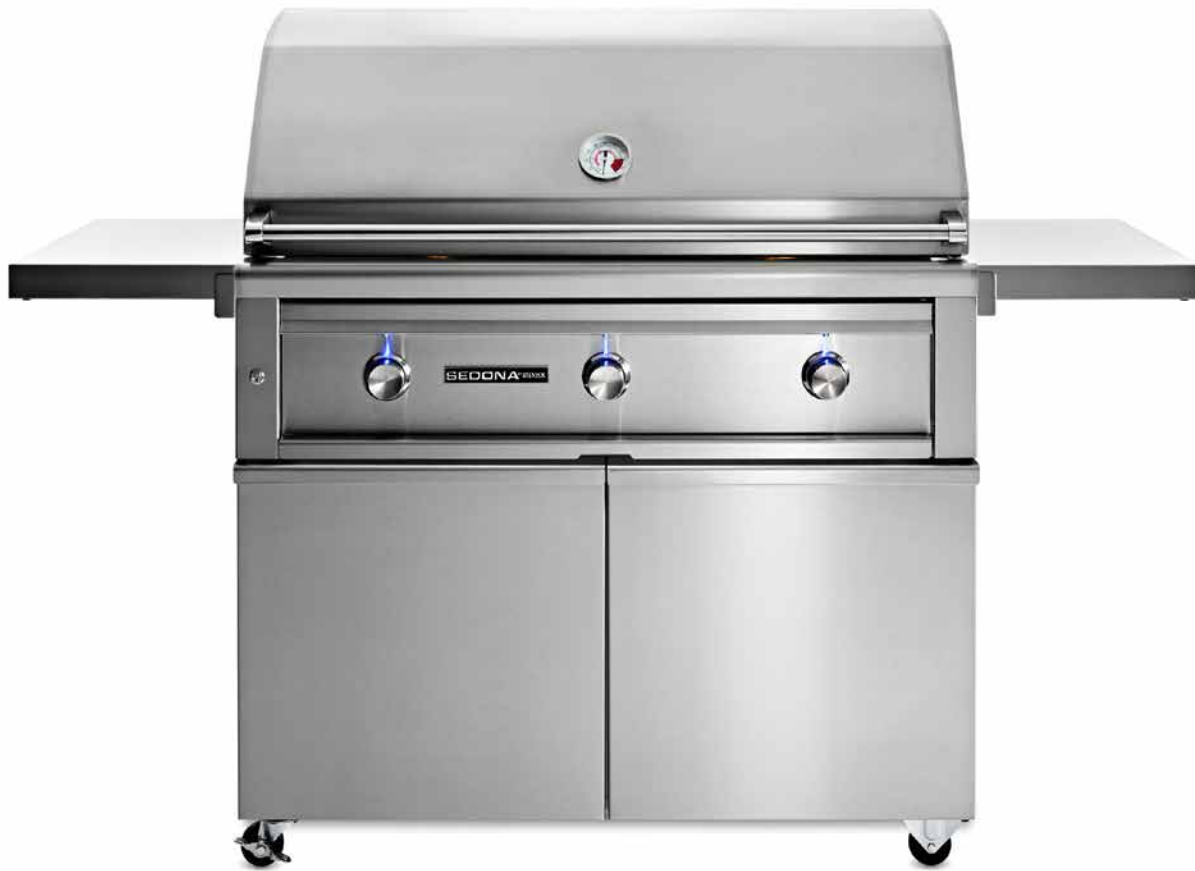
42" FREESTANDING GRILL