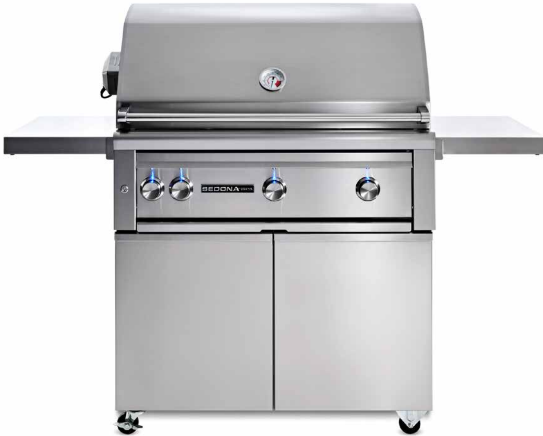
36" FREESTANDING GRILL