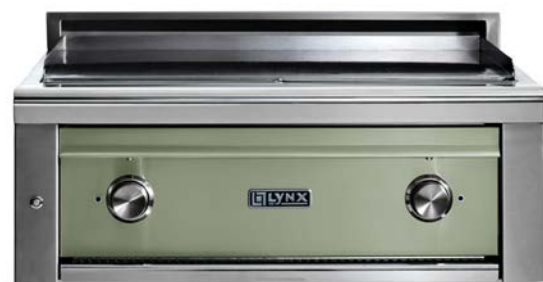
30" PROFESSIONAL BUILT-IN ASADO COOKTOP DISPLAYED IN DESERT SAGE