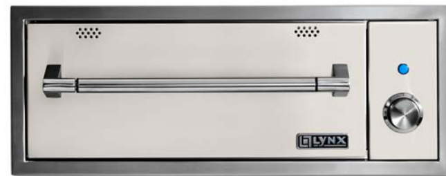
30" PROFESSIONAL BUILT-IN WARMING DRAWER DISPLAYED IN GLACIER