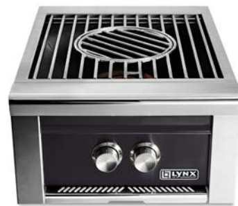
PROFESSIONAL BUILT-IN POWER BURNER DISPLAYED IN OBSIDIAN