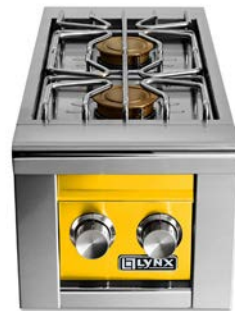
PROFESSIONAL BUILT-IN DOUBLE SIDE-BURNERS DISPLAYED IN CALIFORNIA POPPY