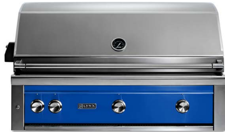
30" / 36" / 42" / 54" PROFESSIONAL BUILT-IN GRILLS DISPLAYED IN PACIFIC BLUE

The Lynx Professional Outdoor Color Collection is available on control panels of a variety of Lynx Grills products while the hood, trim, knobs, and handles remain high-grade stainless steel. These painted panels are powder coated to beautifully withstand the elements.